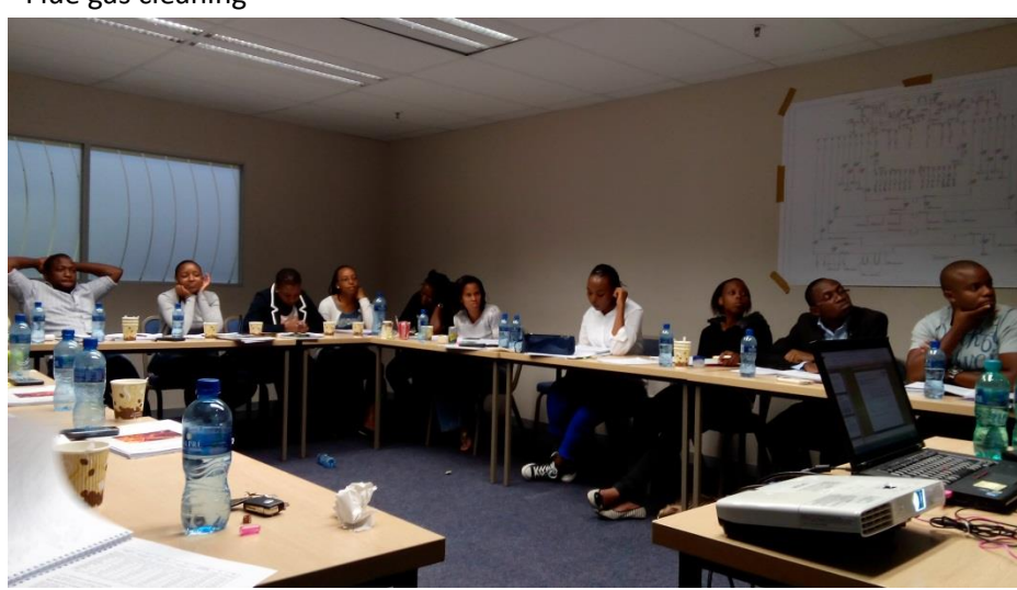
Training situation in South Africa