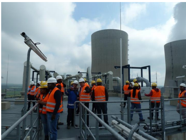
Training group in a German Power Plant

7<sup>th</sup> phase: Submission of project work and practical exams.